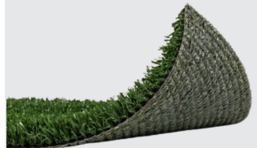
Sample photo does not reflect perforations.